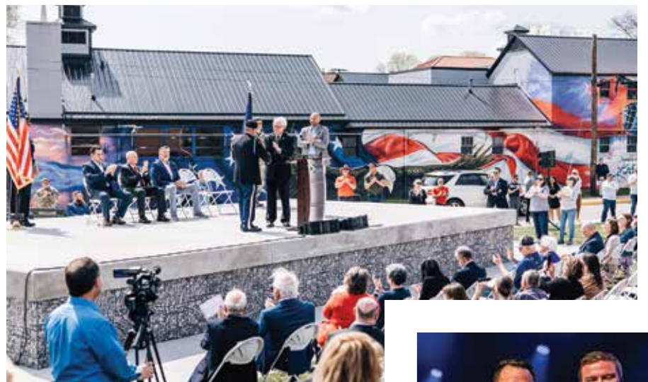
Somerset named SOAR's Downtown of the Year City recognized for success revitalizing downtown

Our community is full of vibrant , scenic views, but it's also full of vibrant, unique people. Both of these make the experience here second-to-none. This is why we invest so heavily in tourism initiatives, arts and entertainment, and history and culture, celebrating who we are and promoting it loudly so others will want to be a part of it. The year 2023 was another one for the record books in this regard: Increases in tourism spending and event attendance dominated the year.