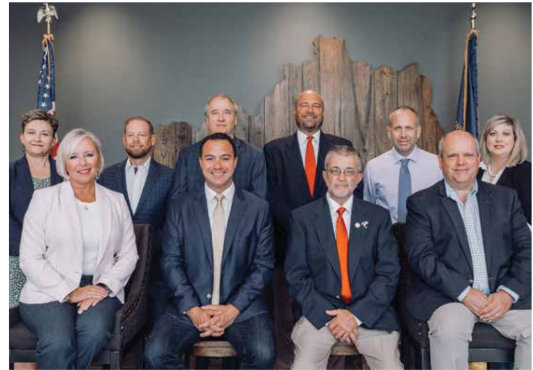
▲ Somerset-Pulaski County Economic Development Authority Board of Directors