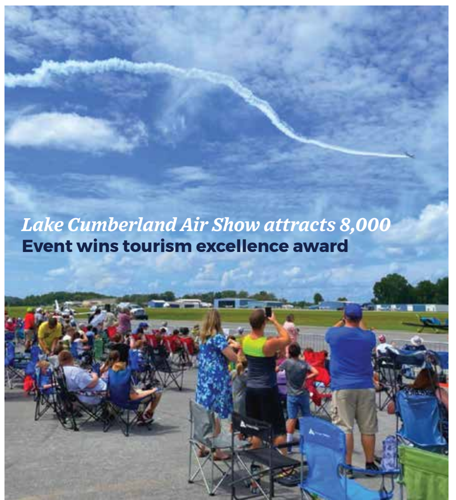
Lake Cumberland Air Show attracts 8,000 Event wins tourism excellence award

SPEDA takes bold action in economic development, making a powerful statement that Somerset-Pulaski County is the friendliest, easiest place in Kentucky to do business. When naysayers suggest our vision is impossible, we keep working. And when our ideas are challenged, we double-down and invest in education and thought-leadership to ensure we're on the right path, together.