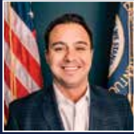
Alan Keck Founding Member Mayor, City of Somerset