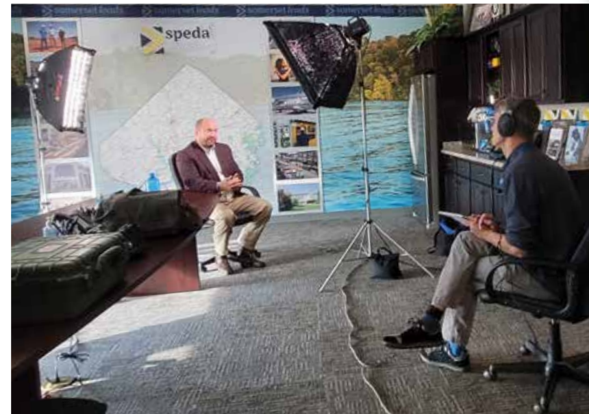
▲ SPEDA President & CEO featured on KET January 2024