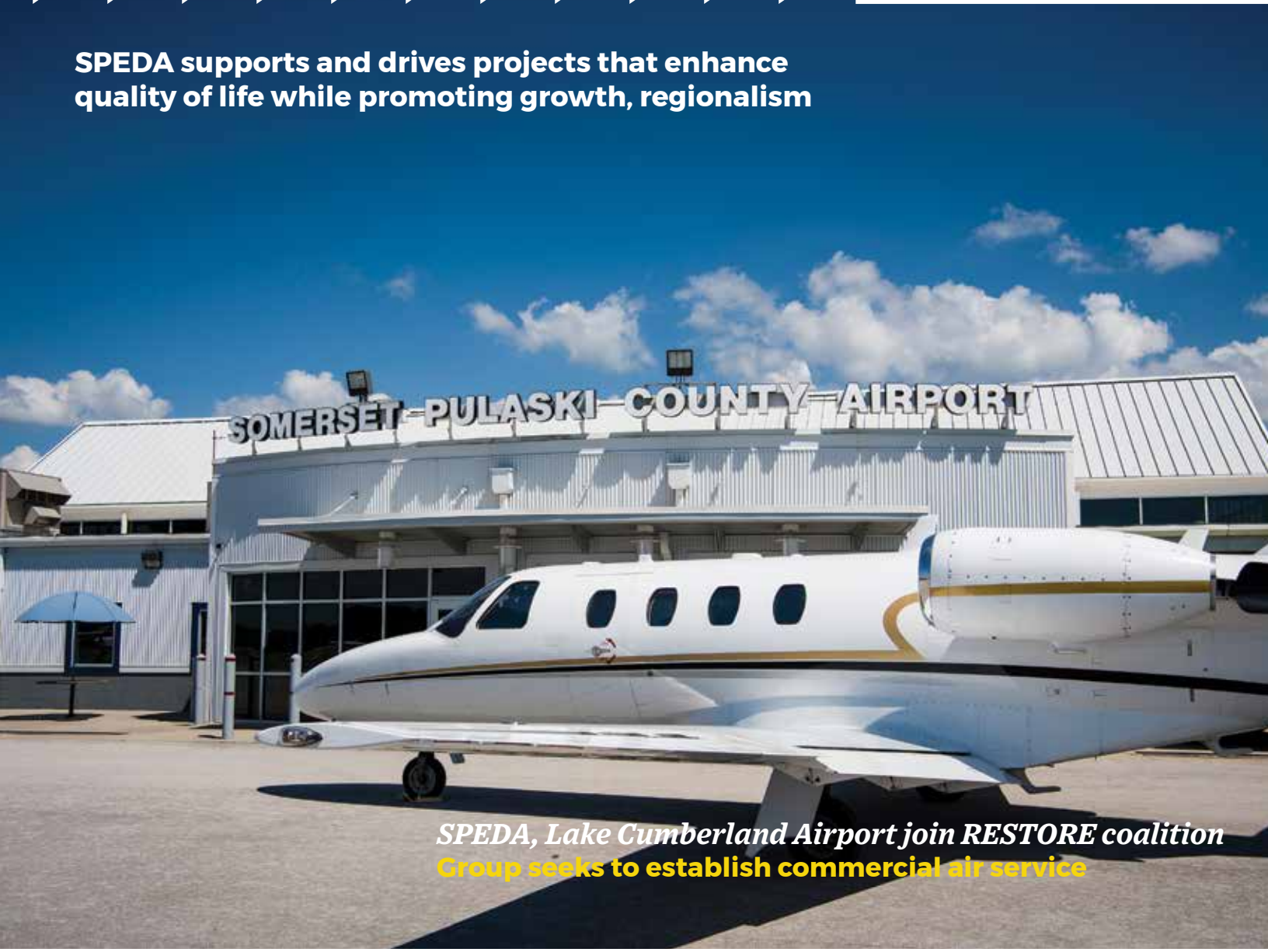
SPEDA, Lake Cumberland Airport join RESTORE coalition Group seeks to establish commercial air service

SPEDA supports and drives projects that enhance quality of life while promoting growth, regionalism