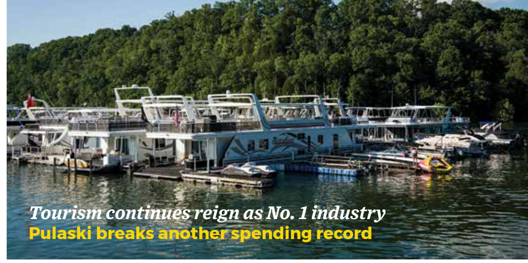
Tourism continues reign as No. 1 industry Pulaski breaks another spending record