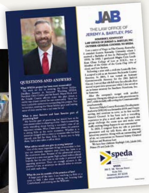
The Lane Report February-March 2024